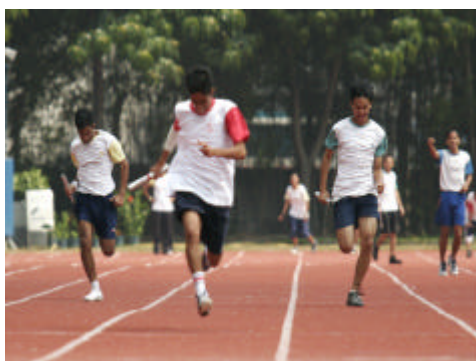
House spirit that exists at SEKSS.

One innovation by the PE staff was the inclusion of a staff and House game. With five hoops laid out upon the ground, teams from each House had to get as many small beanbags from the centre hoop back to their respective area in one minute. To add a little bit of spice to the event, competitors were allowed to go to any of the other House hoops to collect their bags also. All competitors revelled in the fun challenge and the support from the grandstand for each House highlighted the tremendous